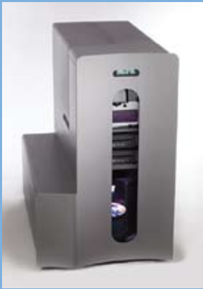
Rimage Producer III CD/DVD/BluRay autoloader