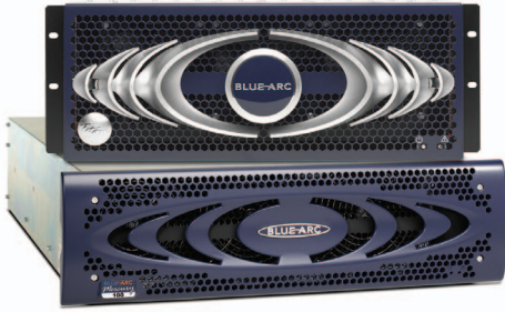
BlueArc Network Storage Servers