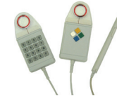
DrawingBoard VI digitizers work with a variety of cursors and stylus pens